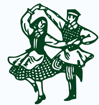
dance and games