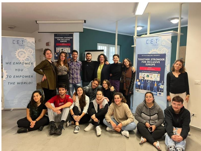
Together Stronger for Inclusive Europe Seminar, 15-22 October 2021