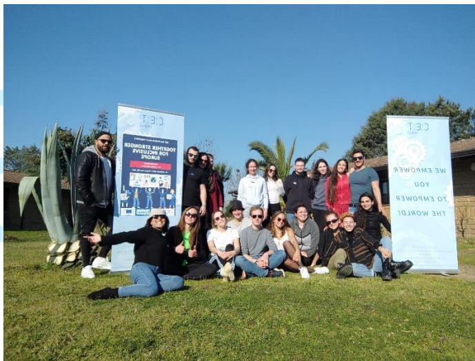
Together Stronger for Inclusive Europe Training Course, 16-23 March 2022

As NGO, our mission is to improve the level of competences and skills of young people and youth workers, as well as to foster intercultural learning, active citizenship and social inclusion through non-formal education principles and methodologies. Our vision is to empower youngsters to shape the world they live and work in, enhancing creativity, innovation and entrepreneurship. We want to help young people in their personal and professional growth to contribute to the sustainable development of European society